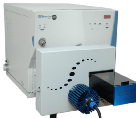
Figure 2: LDTD system on Thermo Vantage Mass Spectrometer.