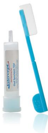
Figure 1: Intercept® Oral Fluid Drug Test