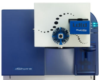
Figure 1: LDTD interfaced to AB SCIEX TripleTOF ® 5600 System