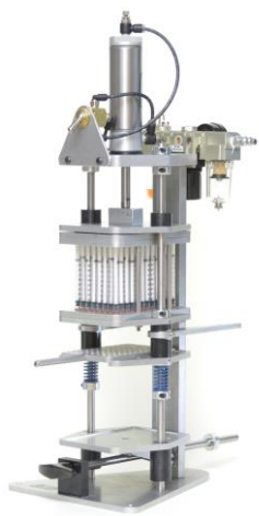
Figure 2: DPX semi-automated extractor