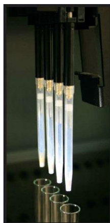
Figure 1: DPX WAX tips using Tecan freedom EVO™

The DPX Polar tip is used for the sample extraction procedure.