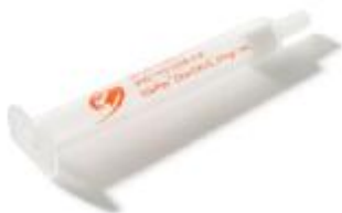
Figure 1: SilliaPrep CleanDrug SPE cartridge

The SiliaPrep CleanDrug cartridge is used for the sample extraction procedure.