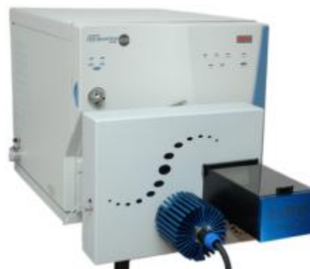
Figure 2: LDTD system on Thermo Vantage Mass Spectrometer.