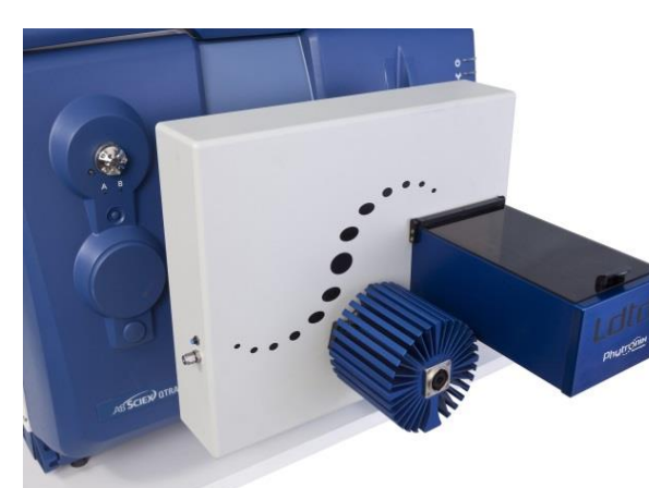
Figure 2 LDTD system on Sciex 5500 QTrap ®

* LazWell™ coating: 96-well plates are pre-coated with 5µL of an EDTA solution (100 µg/mL) in MeOH/H 2 O/NH 4 OH (75/20/5) which is dried before sample deposition